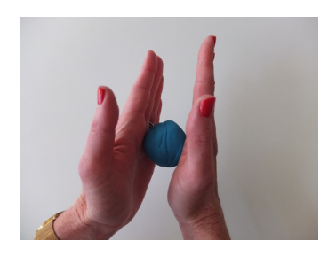
roll (into a ball)