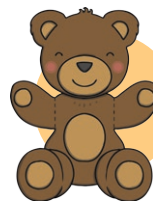
An object to pass around such as a teddy