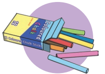
Chalk to record on the ground