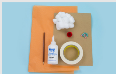
– Sticky tape